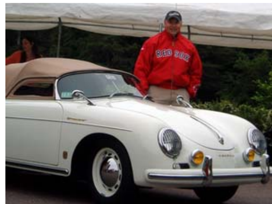
The now world-renown DiCorpo speedster at German Car Day '05