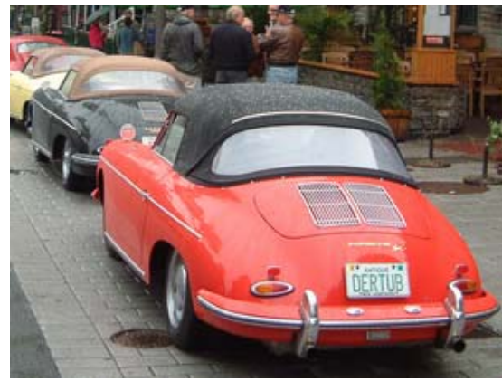
Is Judy Hendrickson's cab Typ356ne's closest relation to the '66 cop cabs?

They also cover the Barrett auction, marveling at the $135,000 cabriolet .