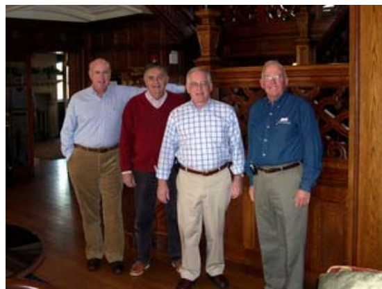
Spring Tour Planning committee

Check the Schedule of Events at www.typ356ne.org for updates.