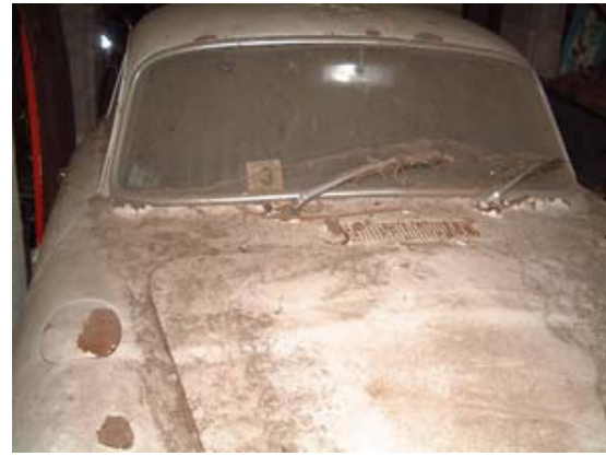
Part of the Gentz project car inventory

Our group hooked up at the LAX Sheraton midday on Friday after renting a pair of Mini Vans (plus Jim O'Hare's son's massive Chevy pick up for the weekend). First on our agenda was an open house at Wilhoit Restoration . In and around this shop it was easy to see how a total 356 restoration can suck up a tubful of money. The quality of their work is exceptional and the number of cars awaiting restoration boggles the mind. By mid afternoon we headed for Los Alimitos for open houses at GTwerk and Ansite Inc. This turned out to be a fascinating cluster of four Porsche (356 & 911) related shops. Robert Kamm of GTwerk reproduces GT and other early Porsche parts while Jim Ansite is in the process of restoring a 550 Spyder. Jim and Rainer spent a good two hours comparing the similarities and differences of the California Spyder and Rainer's own in Alton, NH. As the shops closed for the weekend, Bob Kamm pointed us toward Wally's Wharf, an excellent seafood restaurant one block from the surf in Seal Beach. Our evening meal lasted a bit longer than our fellow diners might have wished, but the decimation of Dungeness Crabs, Halibut, Alaskan King