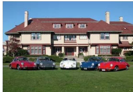
The Ocean Edge Resort

On Saturday, we head down to Provincetown and a specially catered luncheon at Napi's.