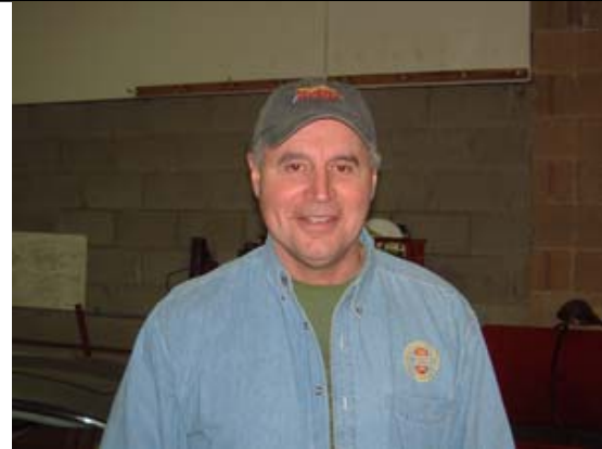
The Prez at KAM