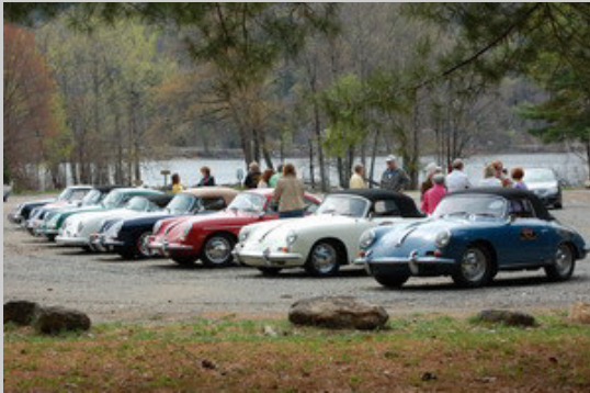
356's at Sacandaga Lake