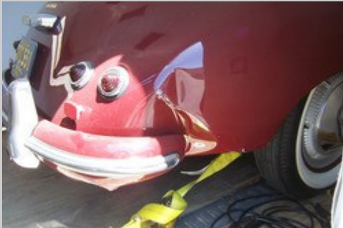
"The Porsche's pretty messed up, but repairable"

carDomain is something I'm just getting to know... carDomain is "The place to show off your car pictures and photos". At the moment they suggest you "Browse 667,776 custom cars and trucks at the world's largest car show". That doesn't include over 3 million cars for sale. Why is this new to me?