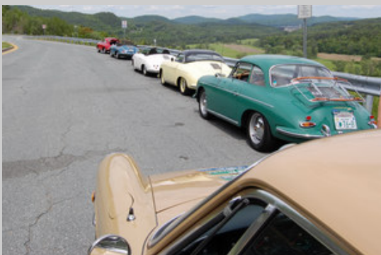
Tourmeister Don Osborne left the Friday drive unstructured so groups travelled (and stopped at scenic overlooks) on their own schedule -- but not late for cocktails in Stowe.

Our eleventh Spring Tour took TYP 356 Northeast to the famous Trapp Family Lodge in Stowe Vermont , our second trip to Stowe – both fabulous. Returning Tourmeister Don Osborne kicked it up another notch for his second tour -- opening first an international tour marketing division and unsatisfied with success in that effort of welcoming drivers from South Africa with an intercontinental tour marketing division .