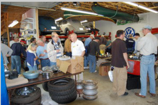
The Collin's Toy Box was full.