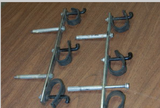
Mohn Ski Rack, not factory, but cool

Second was the Mohn Ski Rack Company 3 pair ski carrier. Designed to fit the factory luggage rack bosses, so single and dual grille cars are well served.