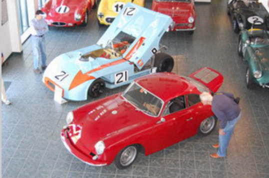
Toys of every description at KTR