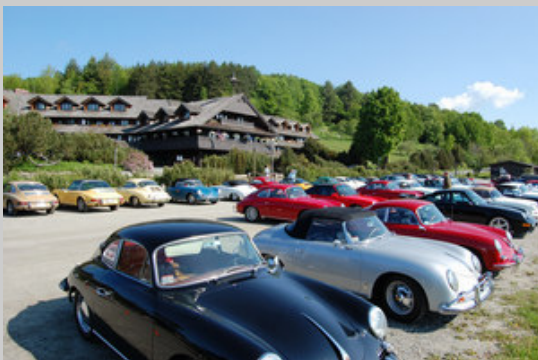
Thirty 356's at the Trapp Family Lodge

While one would hate to disparage all the other great driving elsewhere in the Northeast, the roads of Vermont truly offer many spectacular drives – whether navigated by precise plan, serendipity or just being lost!