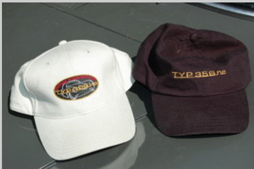
TYP356ne patch (left) or script (right)

That's Lands' End Business Outfitters website at http://ocs.landsend.com/cgi-