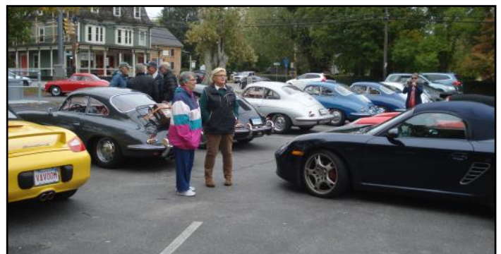
Saturday mornings gathering at Gray's Ice Cream in Tiverton