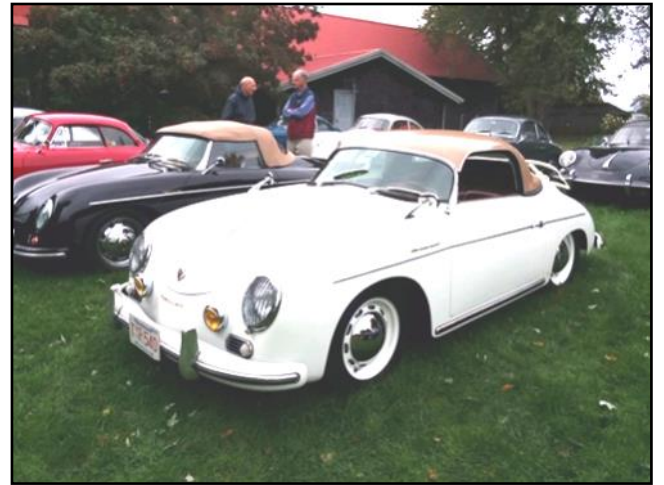
Lunch and wine tasting at the Westport Rivers Winery