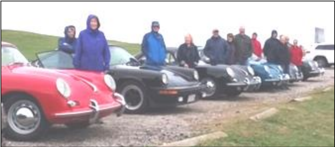
Brenton Point State Park