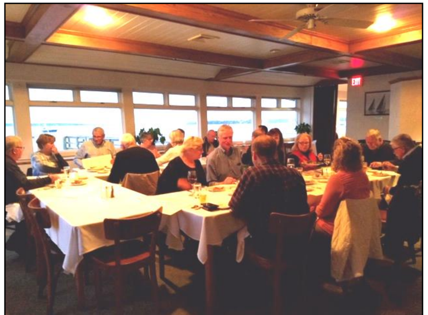
Dinner at the Lobster Pot