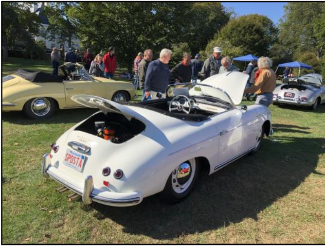
Rich MacKoul's 55 Speedster