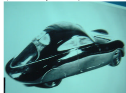
Early Typ 114 concept for a self-produced Porsche sports car