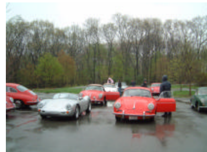
Call it Winter '05 in May