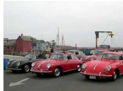
The Motif #1 part seems to be factual. Photo by Crawford