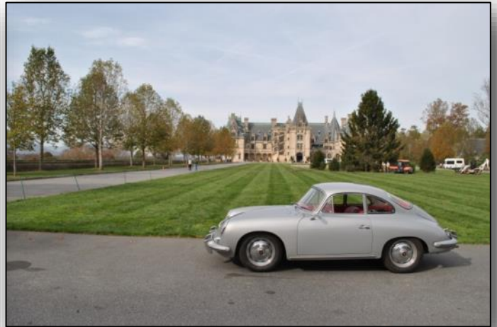
The Biltmore Estate, Asheville, NC