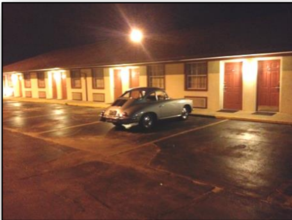
Four Star Motel, Seminole, OK

Erick, New Mexico, home town of Roger Miller and Sheb Wooley